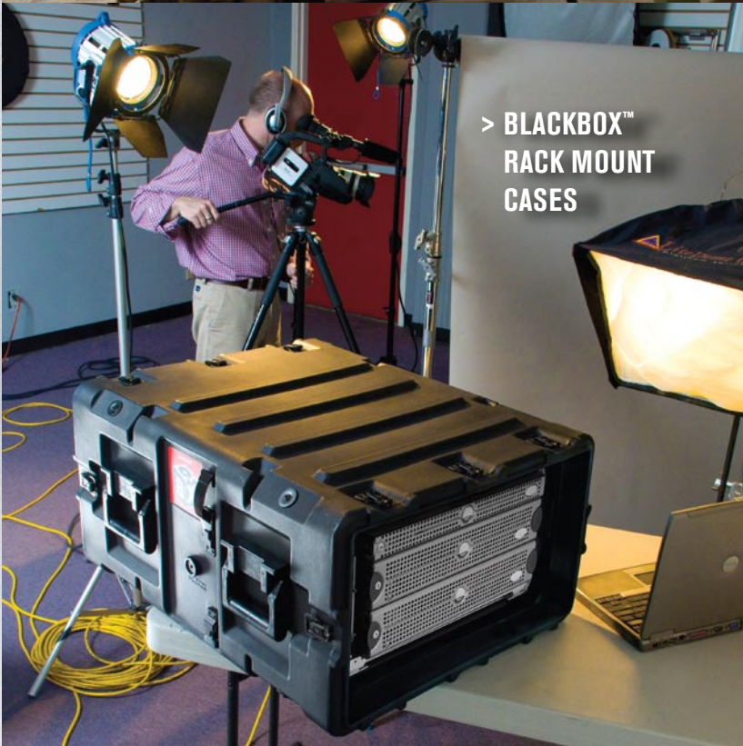
> BLACKBOX™ RACK MOUNT CASES