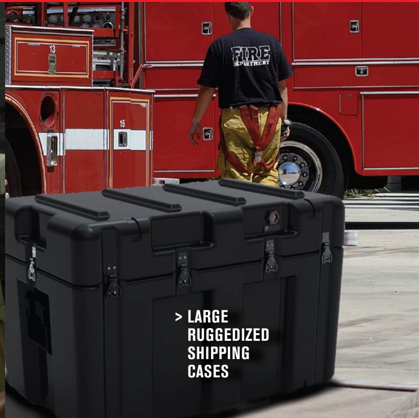
> LARGE RUGGEDIZED SHIPPING CASES