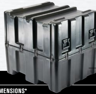
XX-LARGE RUGGEDIZED SHIPPING CASE CATALOG NUMBER: AL3834-1617-110

Transport and protect big equipment in our Large, X-Large, or XX-Large Ruggedized Shipping Cases. These cases are lightweight, shockproof, watertight, dustproof, heat, and chemical-resistant, which make them extremely tough and offer ultimate protection that will move your equipment from point A to point B without a scratch.