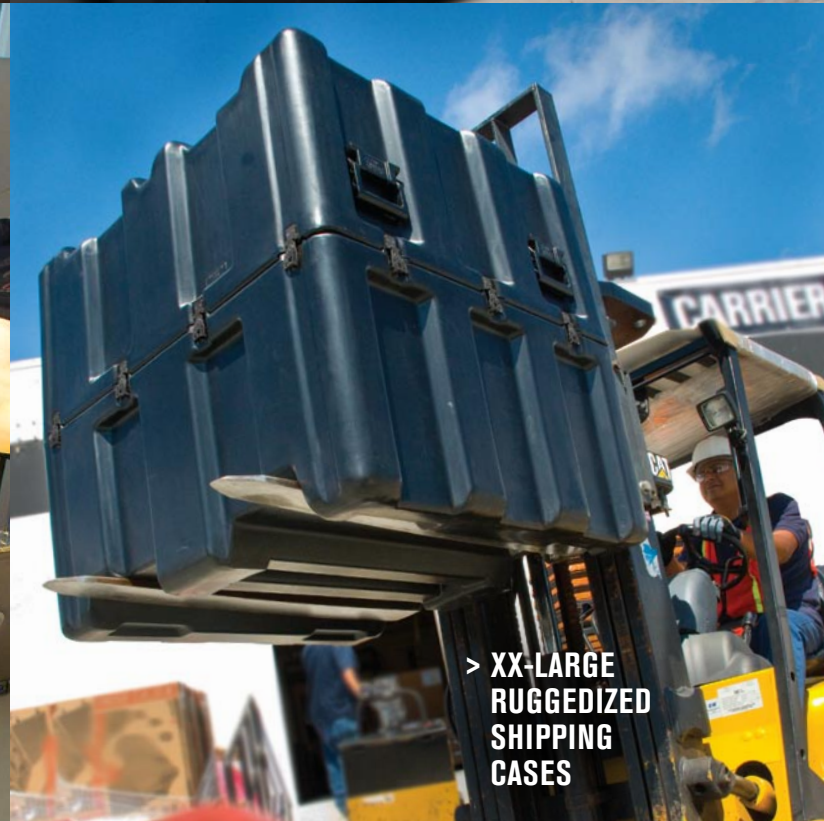
> XX-LARGE RUGGEDIZED SHIPPING CASES